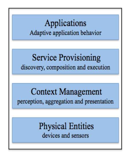
Figure 1. Generic architecture for context-aware service provisioning [4]

Based on the generic architecture, several context-aware service frameworks have been proposed. The Akogrimo framework [5] provides data, knowledge, and computational services for mobile users on the Grid. Based on a context model, CA-SOA [6] proposes different components to support context-aware discovery and access Web services. In [7], a framework that supports the development of contextaware adaptable Web services is introduced by separating clients/web services from the context framework.