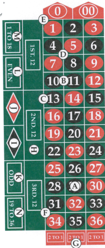
TABLE OF ODDS